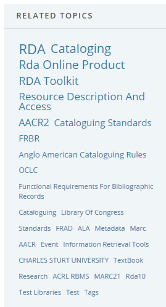
Figure 2 – 'Related Topics' suggested by Wordpress

The methodology outlined in the preceding chapter was largely successful at producing a moderately sized yet broad corpus. The initial search of Wordpress's designated search engine retrieved 48 responses, all of which were considered for this study. As this search engine only retrieved blog posts which had been tagged with the terms 'RDA' or 'Resource description and access' as a user assigned taxonomy, an attempt was made to use the 'related topics' tab supplied by the search engine.